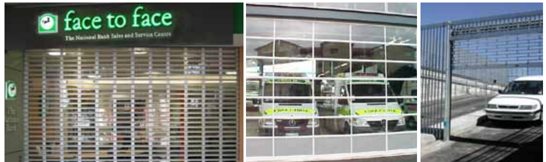
Right; Heavy Duty 19mm Grille