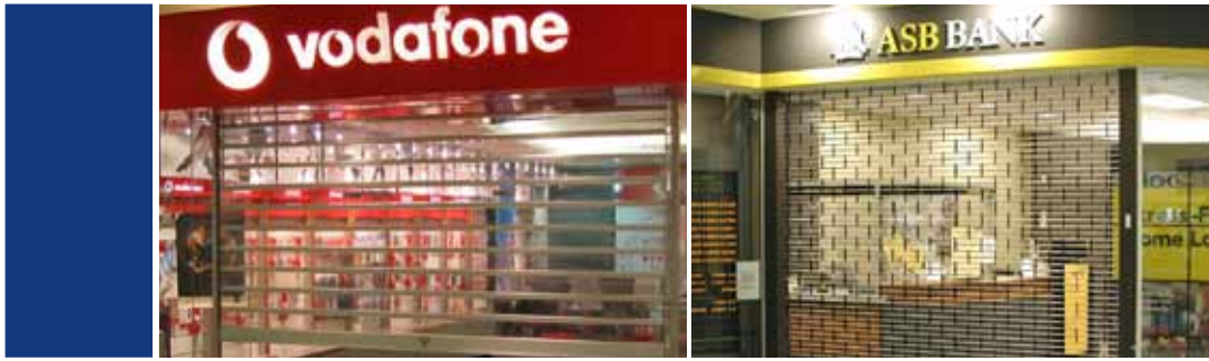
Left; Clearspan Shutter